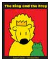
The King and the Frog by Alain Chiche